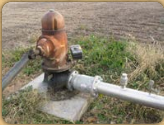
North Irrigation Well