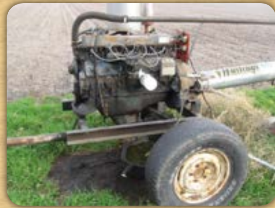
Ford Irrigation Engine