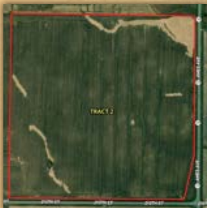
Tract 2 Aerial Photo