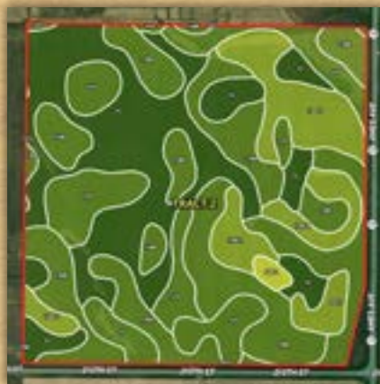
Tract 2 Soil Map