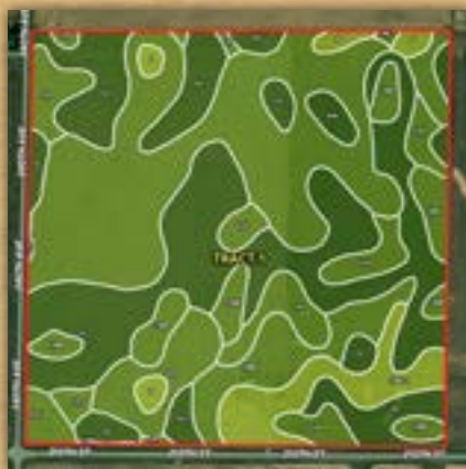
Tract 1 Soil Map